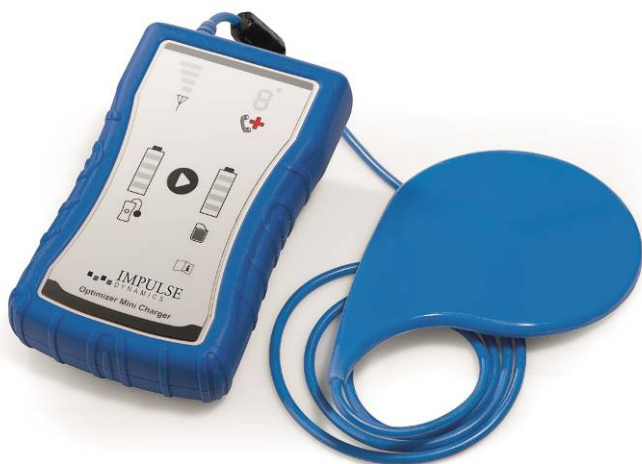
Figure 2: OPTIMIZER Mini Charger

The OPTIMIZER Mini Charger is also powered by a rechargeable battery. The charging wand is permanently attached to the device with a cable long enough to let you set up the charger up to almost 20 in away from you. The charging process runs automatically without requiring significant user intervention. Please refer to Section 9 of this manual for details on the proper operation of the charger.