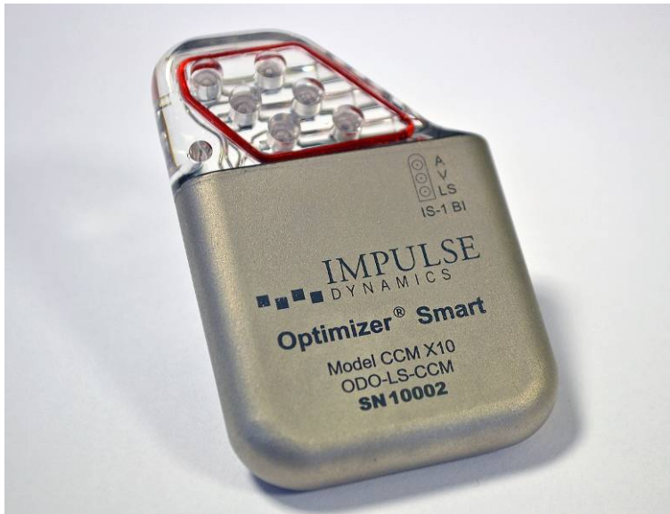
Figure 1: OPTIMIZER Smart IPG

The expected life of the OPTIMIZER Smart IPG is limited by the expected service life of its rechargeable battery. The rechargeable battery inside the OPTIMIZER Smart IPG should provide at least fifteen years of service. Over time and with repeated charging, the battery in the OPTIMIZER Smart IPG will lose its ability to recover its full charge capacity.