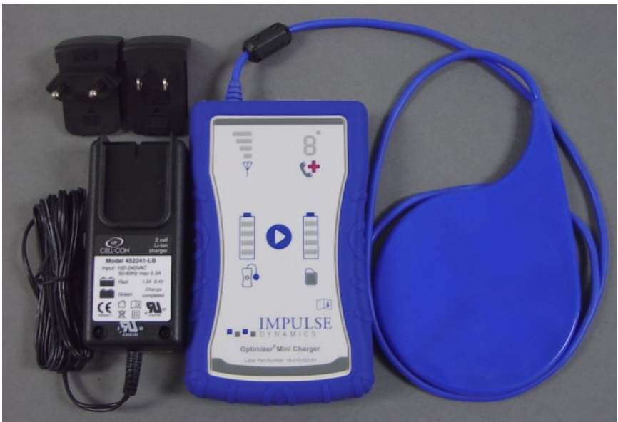
Figure 3: OPTIMIZER Mini Charger with Battery Charger and Plug Adapters