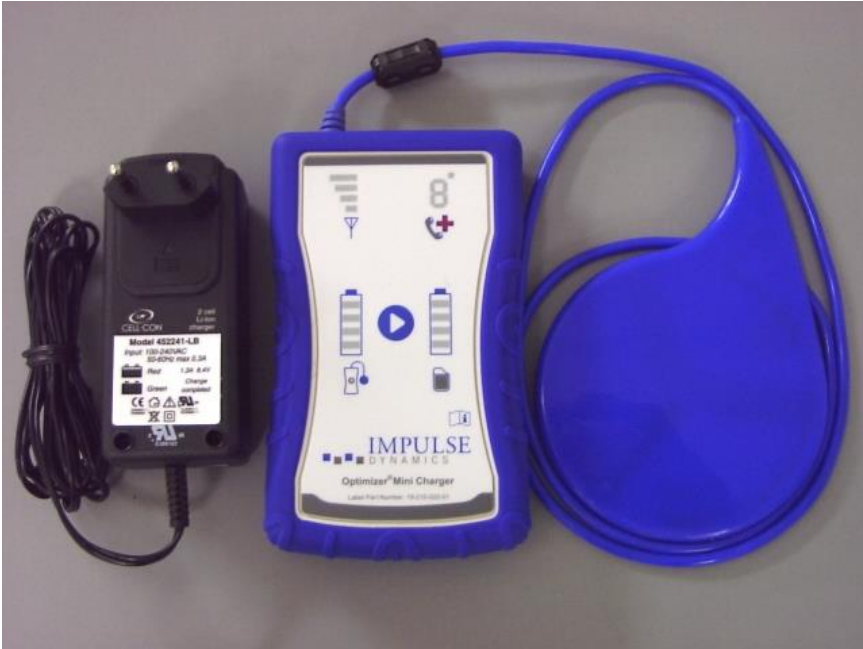
Figure 3: OPTIMIZER Mini Charger with AC Adapter